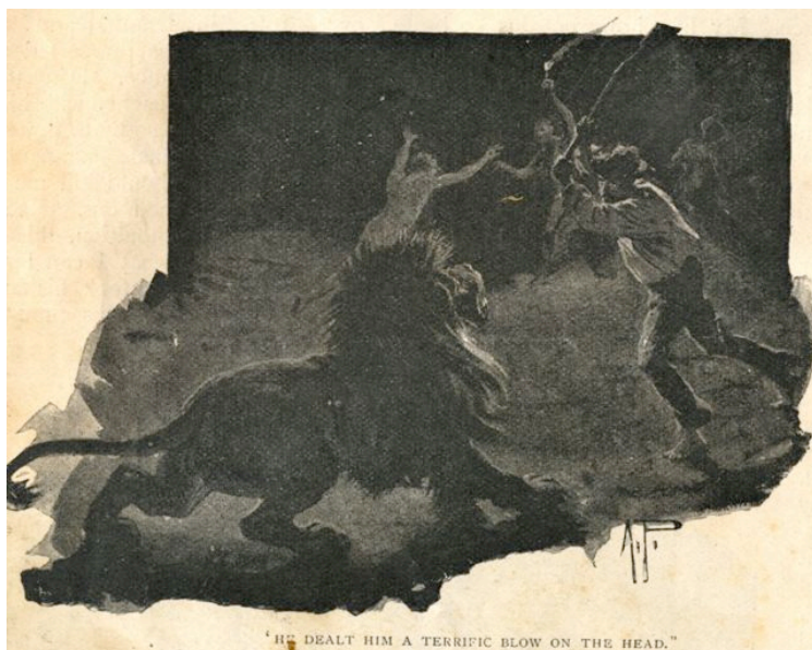
"HE DEALT HIM A TERRIFIC BLOW ON THE HEAD"