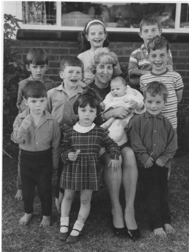
Ouma loved her grandchildren. 1969