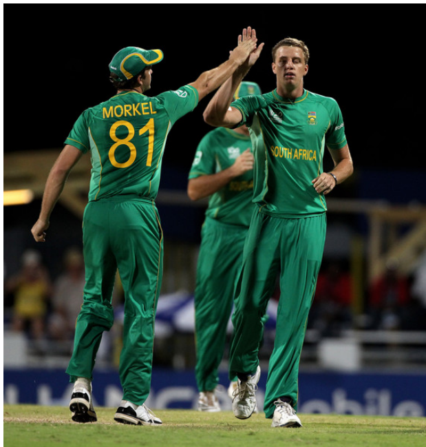
Albie Morkel (R) is congratulated by Morne Morkel for the wicket of Nowroz Mangal of Afghanistan during The ICC World Twenty20 Group C Match between South Africa and Afghanistan played at The Kensington Oval on May 5, 2010 in Bridgetown, Barbados (8)

He had a brief stint with Kent during the 2007 season and then impressed during the ICC World Twenty20 when his pace and bounce proved too much for some top batsmen. A stress fracture early in the Pakistan tour which followed halted the rapid rise, and at the start of 2008, his spell at Yorkshire was cut short by injury, but Morkel bounced back to lead South Africa's attack, without ever being at his