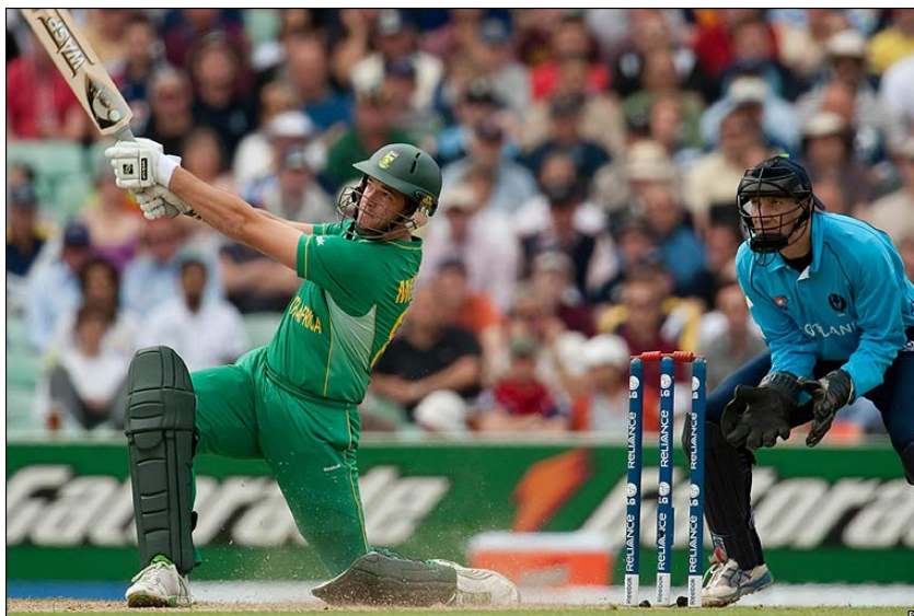
Albie Morkel hit the biggest six seen during the 2007 World Twenty20 and he winds up another at The Oval (11)