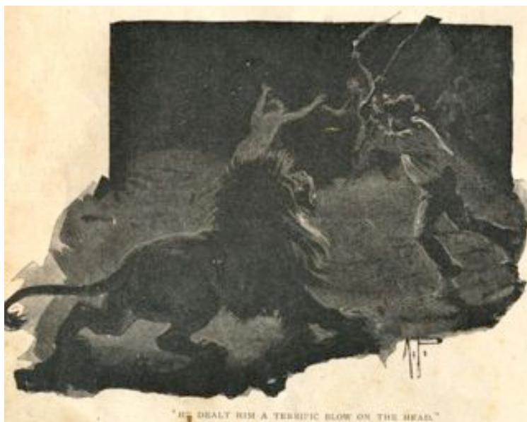
"HE DEALT HIM A TERRIFIC BLOW ON THE HEAD"